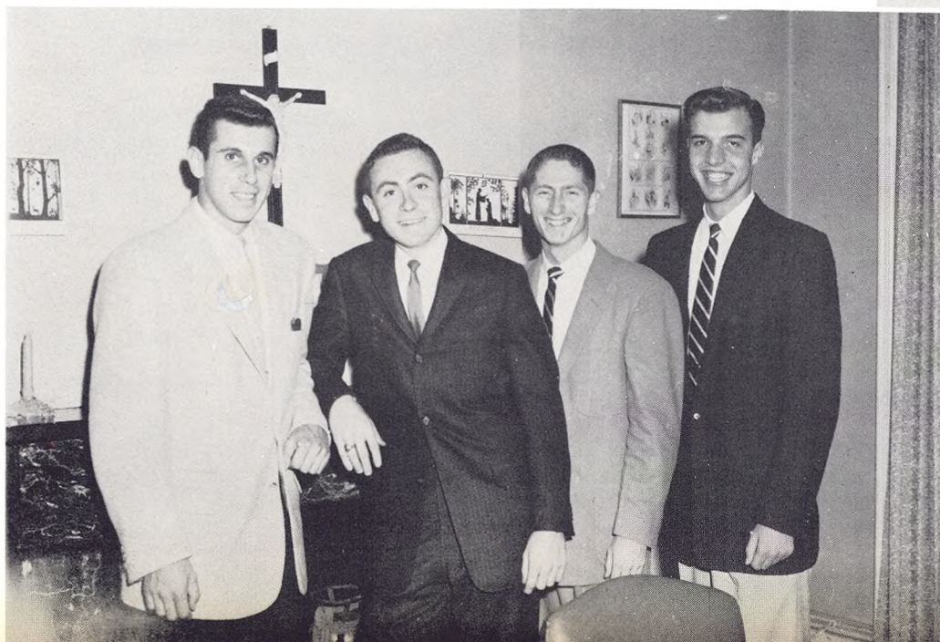
Smiles reflect satisfaction in the work thus far accomplished by the staff.