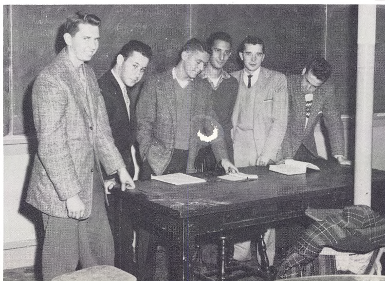
Club members decide on guest speaker for the next meeting.