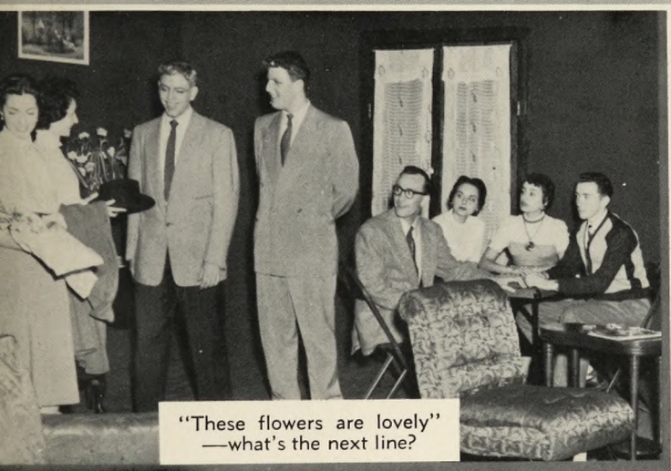
"These flowers are lovely" —what's the next line?