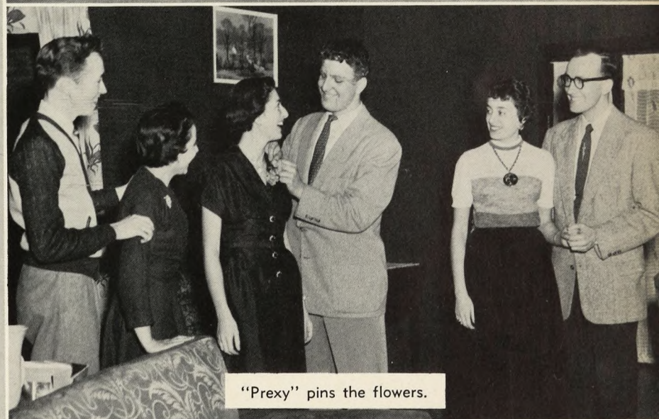
"Prexy" pins the flowers.