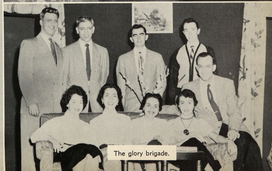
The glory brigade.