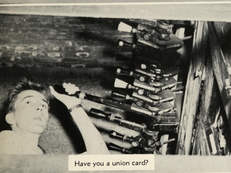
Have you a union card?