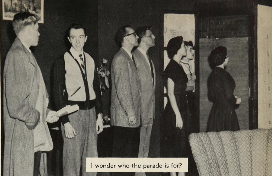
I wonder who the parade is for?