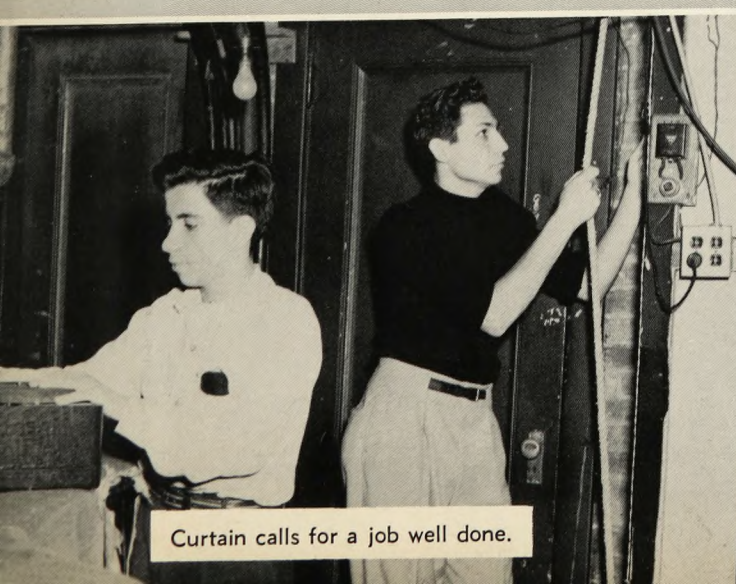
Curtain calls for a job well done.