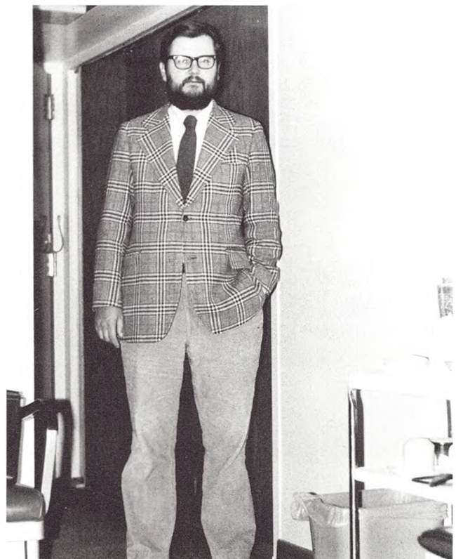
Beware all who enter here!