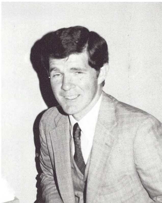
Mom said there'd be days like this!