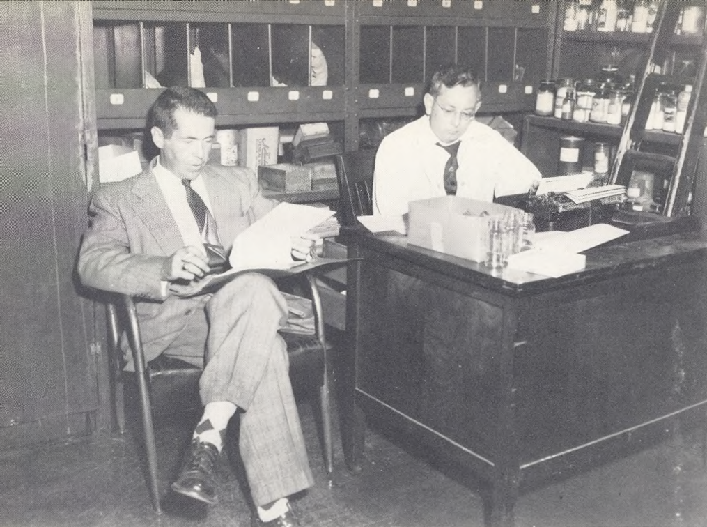
"Ergo, he shall flunk."