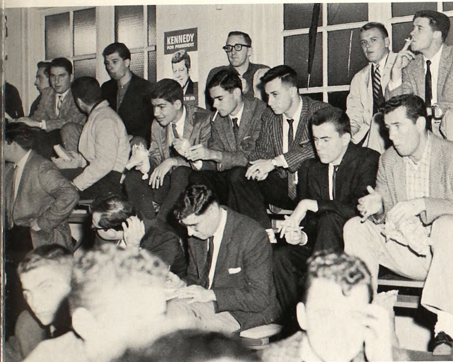
A PANORAMIC PORTRAIT of the Monsignor Kelly Lounge during the annual Political Symposium sponsored by the International Relations Club makes a revealing cross-section of student interest in the national elections.