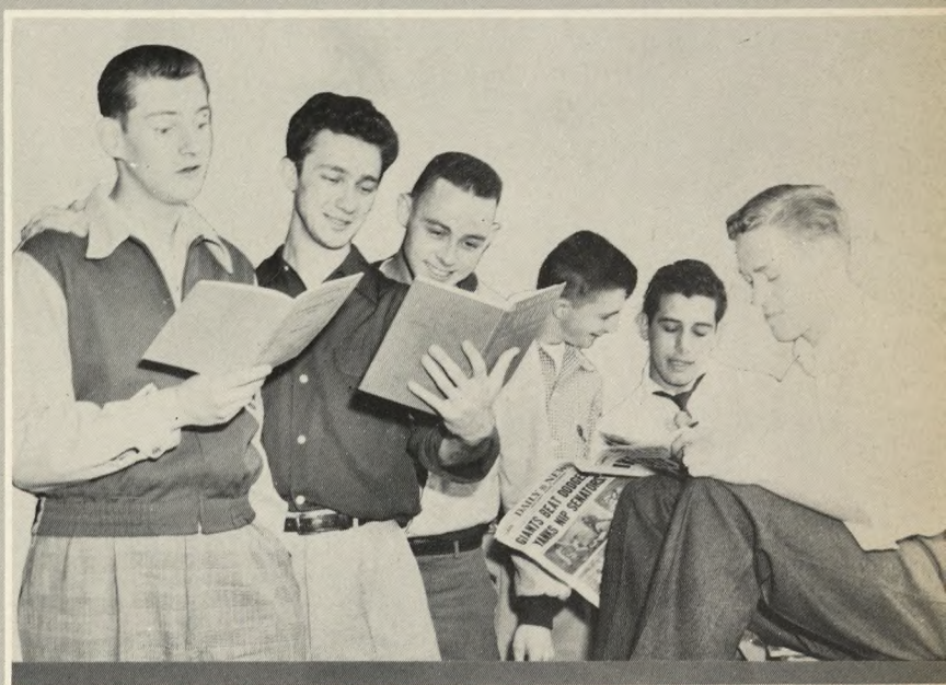
The Pi Alpha five plus one.