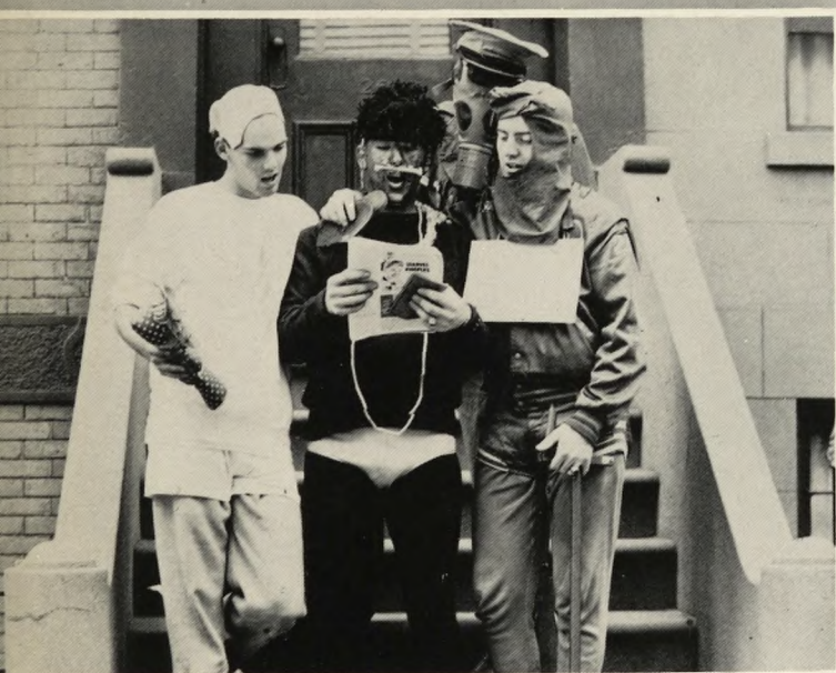
Four part disharmony.