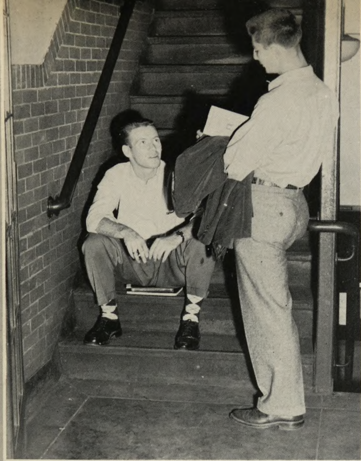
Metaphysical basis for fraternal existence.