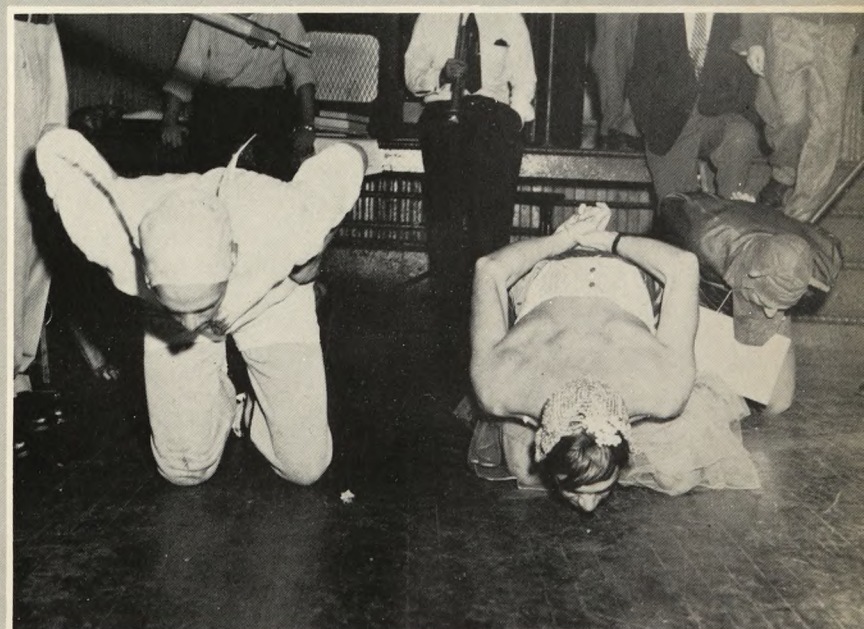
Ballet dancer by a nose.