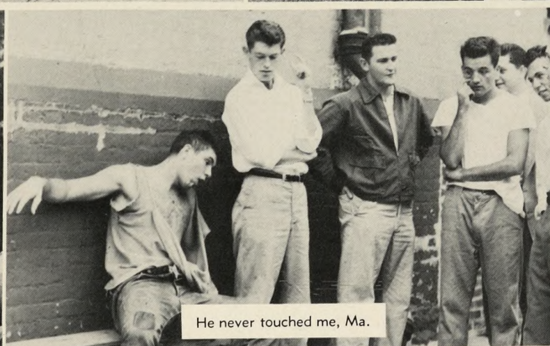
He never touched me, Ma.