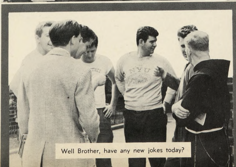
Well Brother, have any new jokes today?