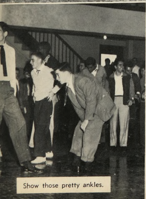
Show those pretty ankles.