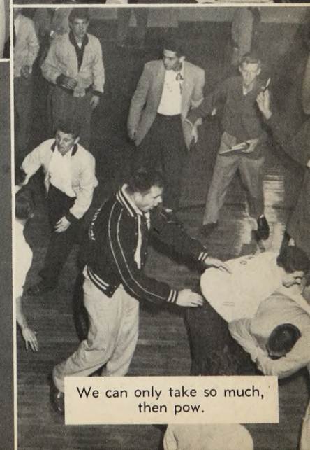
We can only take so much, then pow.