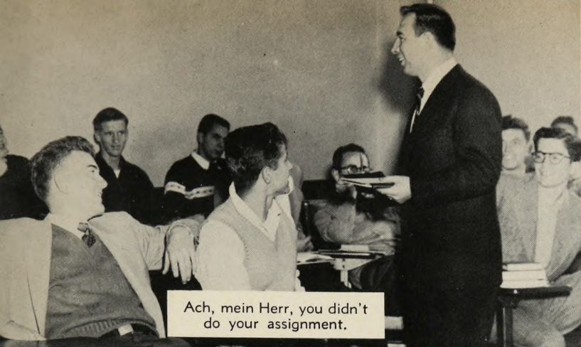
Ach, mein Herr, you didn't do your assignment.