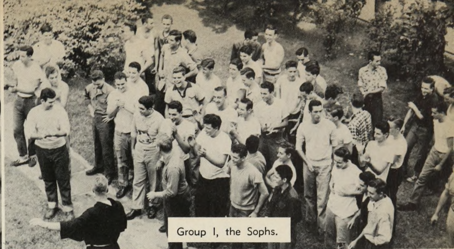
Group I, the Sophs.