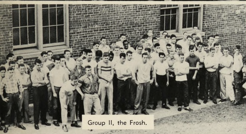
Group II, the Frosh.