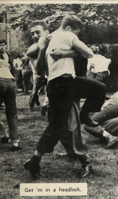
Get 'm in a headlock.