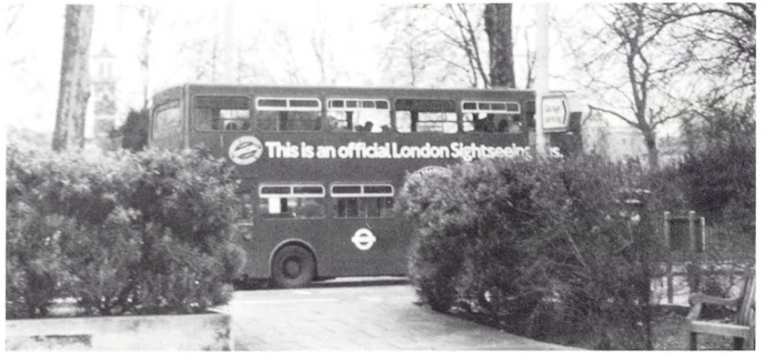
A double-decker bus