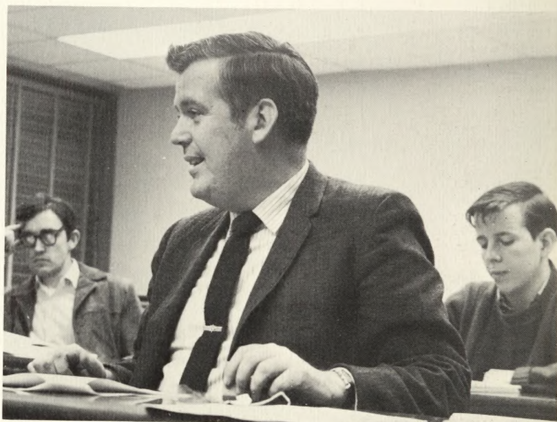
You're talking to me?

Among the many other accomplishments of the student government were the newly organized orientation program, and the opening of a channel of communication to the administration.