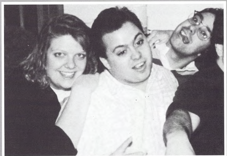
JUNIOR CLASS SENATORS