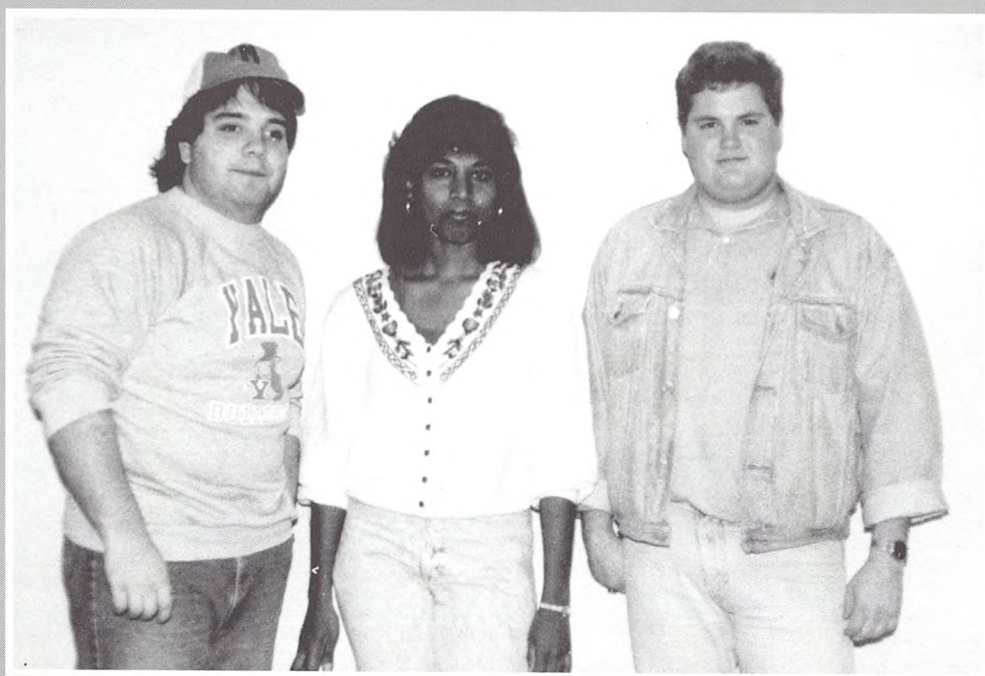
SENIOR CLASS SENATORS