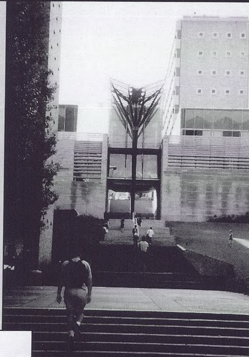
Top right: The lower campus of the University of New South Wales, Australia