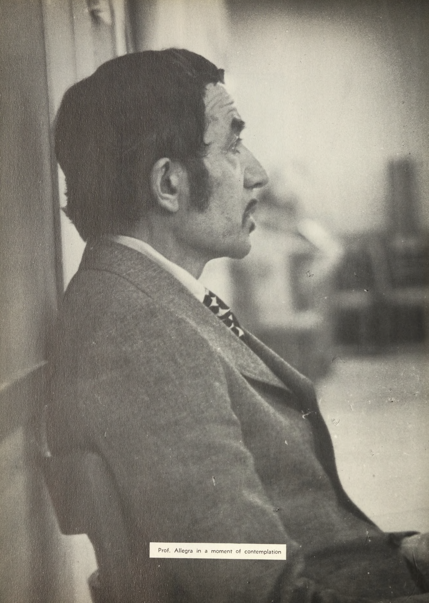
Prof. Allegra in a moment of contemplation