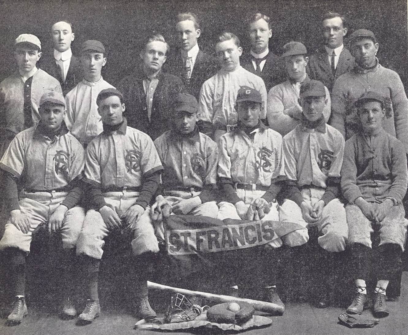
THE TEAM OF 1912