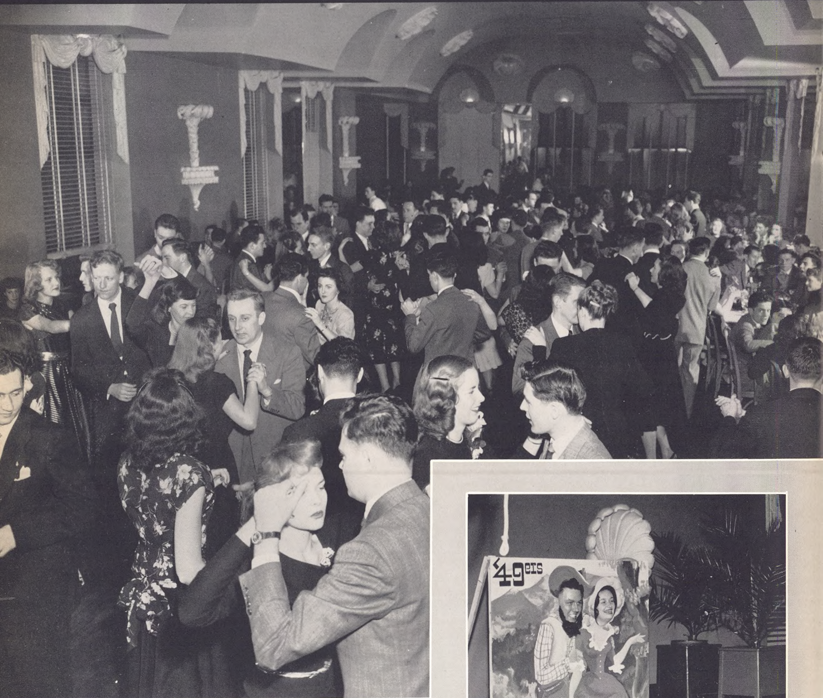
"Buttons and Bows" were in fashion at the 49'ers Junior Prom.