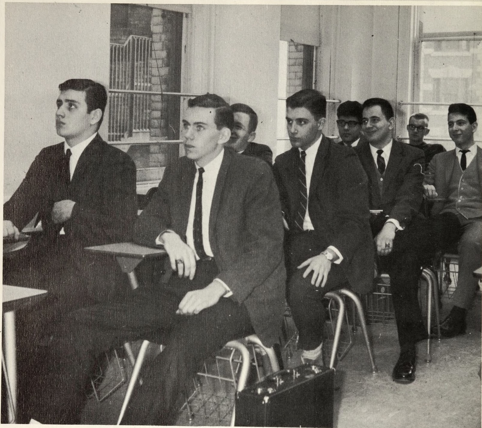
Audiences of this size were a common sight at I.R.C. meetings this year.