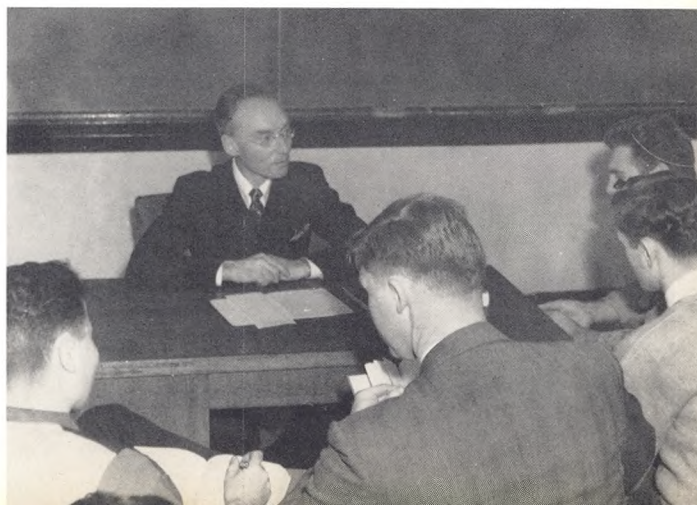
The Doctor and his Patients.