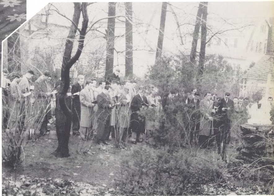
Saying the Stations in the Monastery gardens.