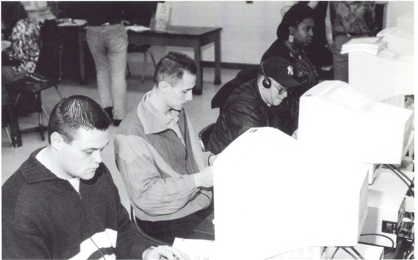
Students working in the Academic Computer center. The center has over 30 computers to type papers or look up information on the internet.