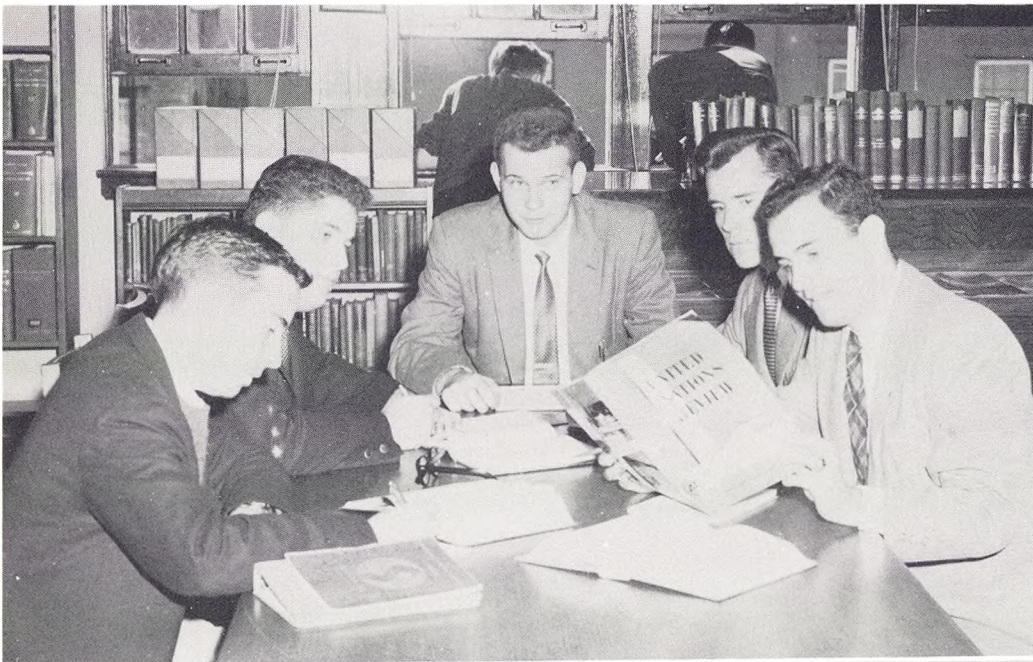
Members keep abreast of problems before the United Nations.