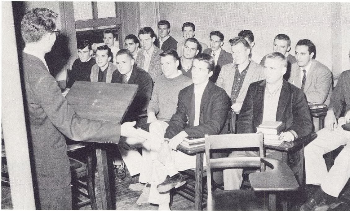
Mr. Doyle comments on the military significance of the launching of the first satellite by the Soviet Union.