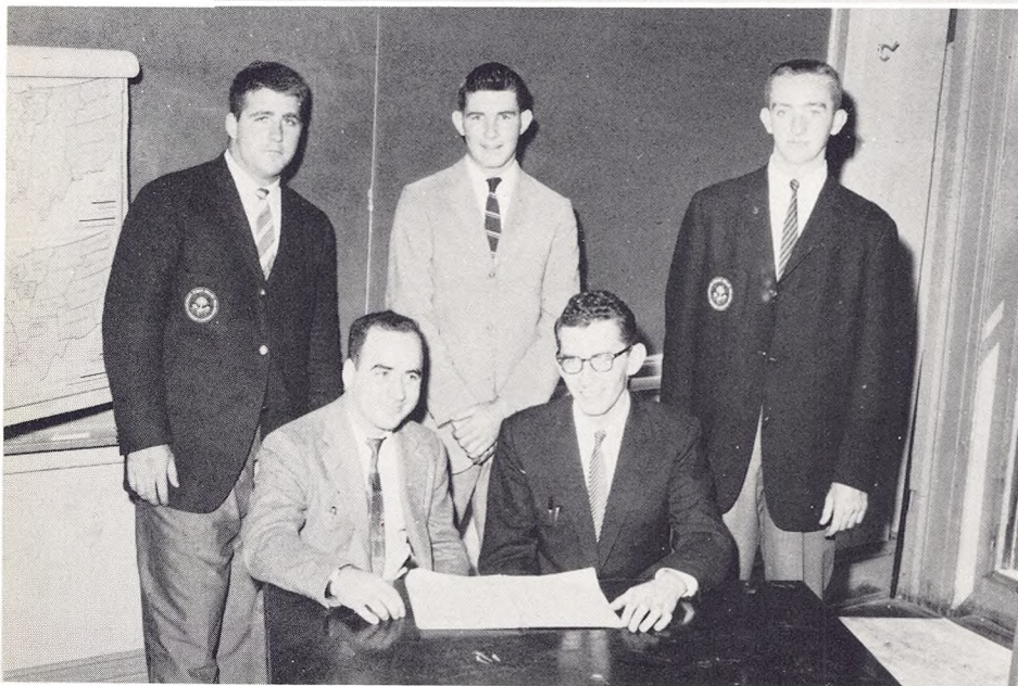
Officers beam proudly after announcing that the club would participate in the National A.I.R.C. Convention in Washington, D.C.