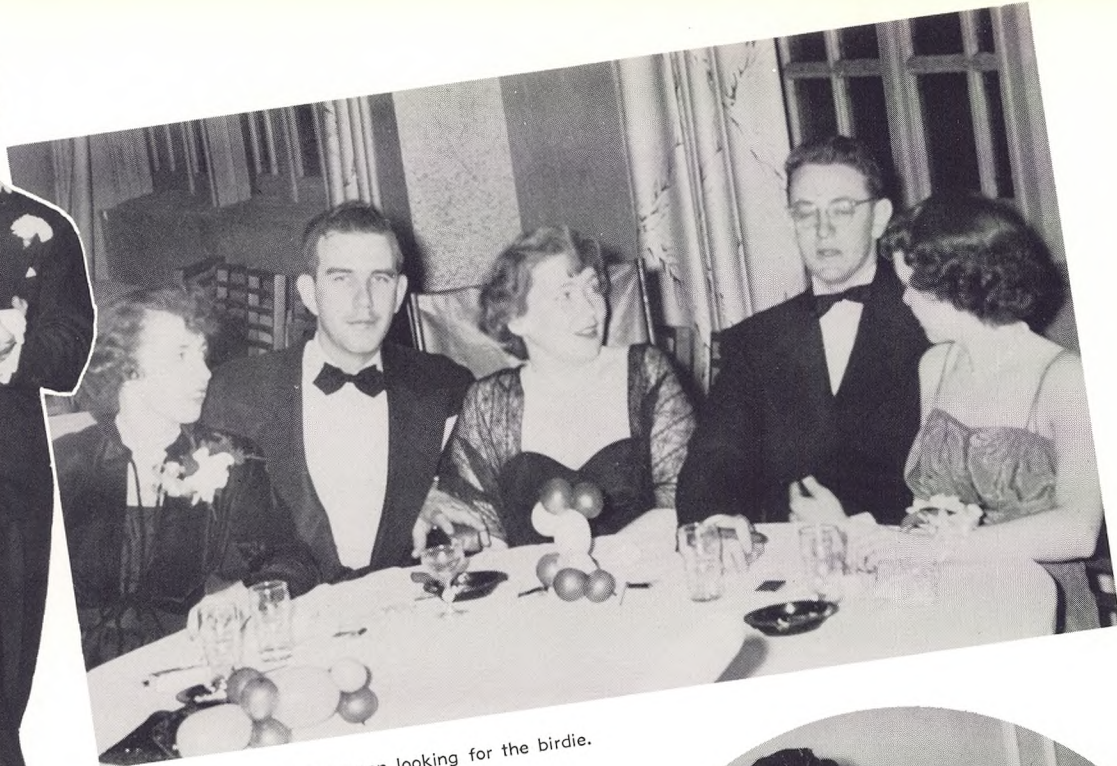
Two elder statesmen looking for the birdie.