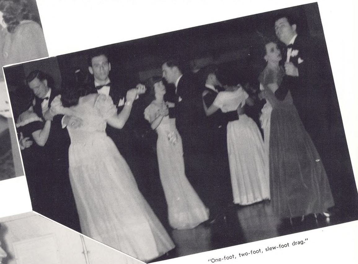
"One-foot, two-foot, slew-foot drag."