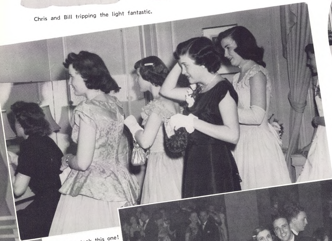
Guess who took this one!