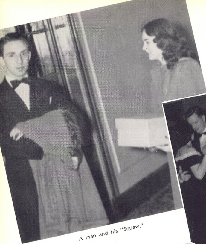
A man and his "Squaw."