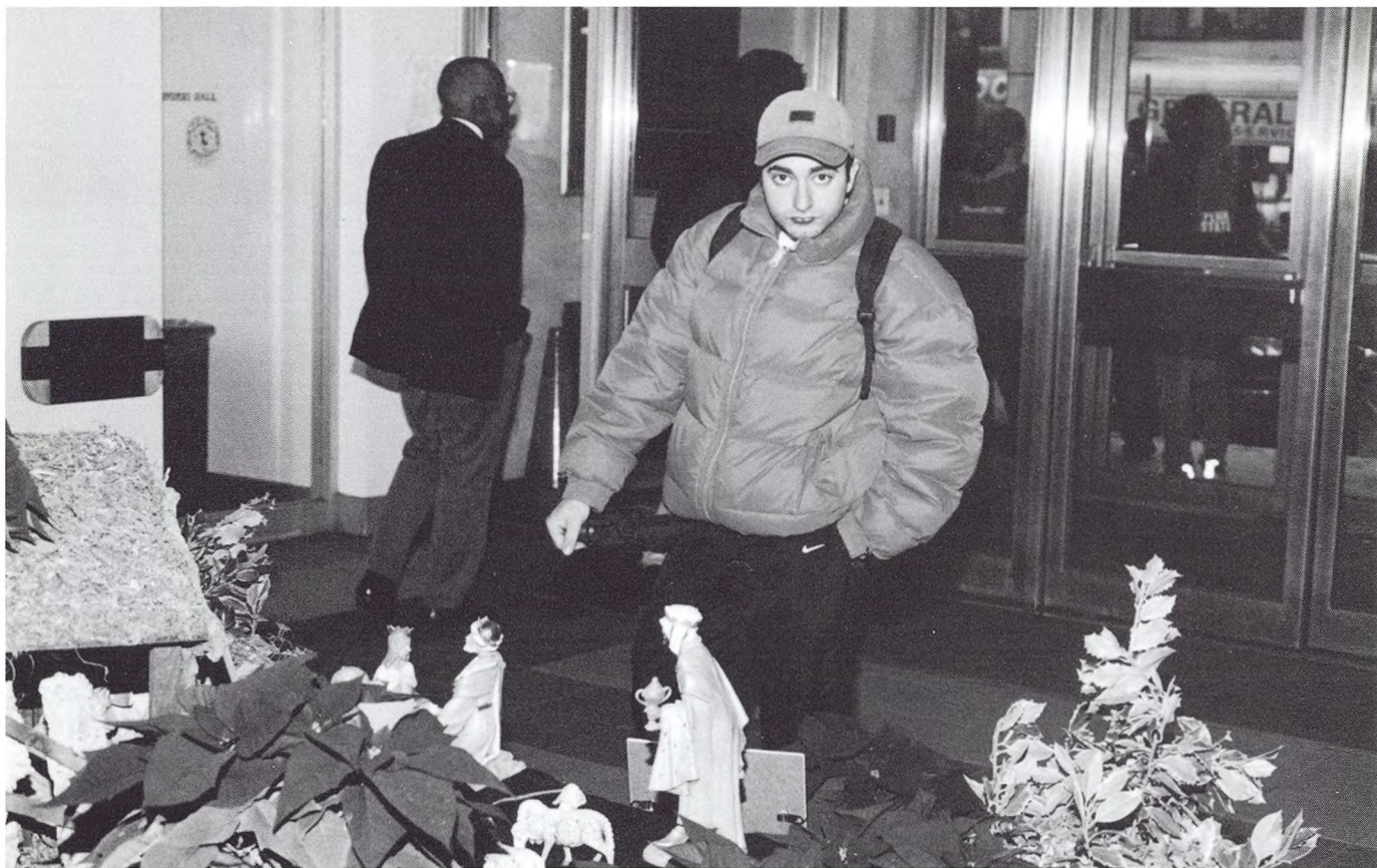
I wasn't going to steal anything!