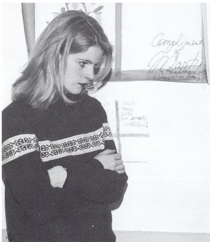
It's freezing by this window!