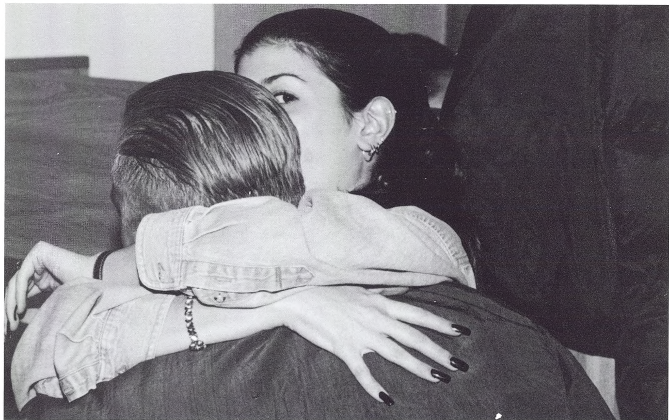
I think the photographer took a picture of us kissing.