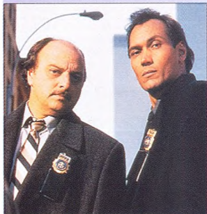
ABC from the Kobal Collection