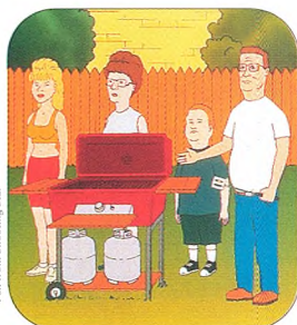
Fox from Shooting Star

Jenny McCarthy stars in a new fall NBC comedy "Jenny" that, in January 1998, goes into hiatus only a few months into its first season. McCarthy had been an MTV personality before moving to the network.