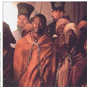
Dreamworks Pictures from Shooting Star