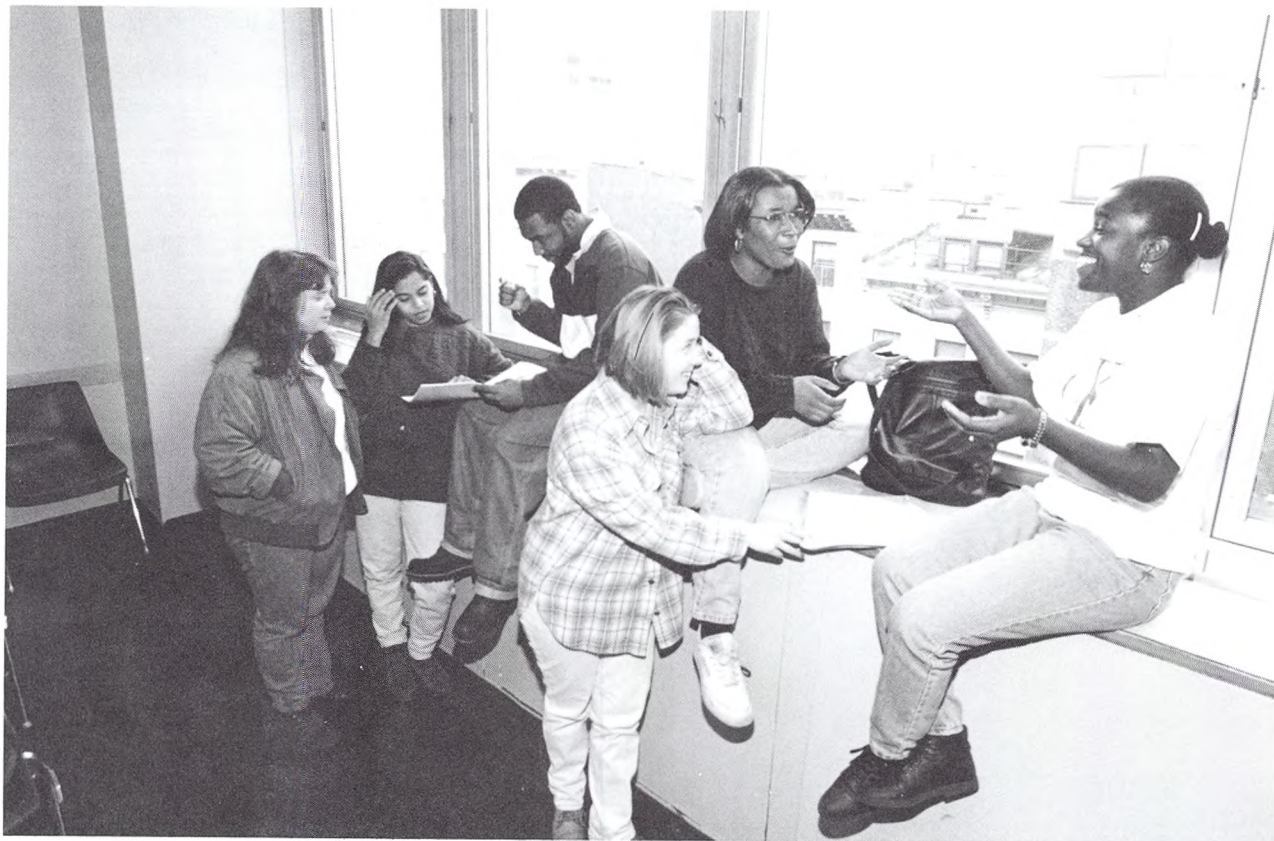
The One Step Program -one step from jumping out of the window during finals!!