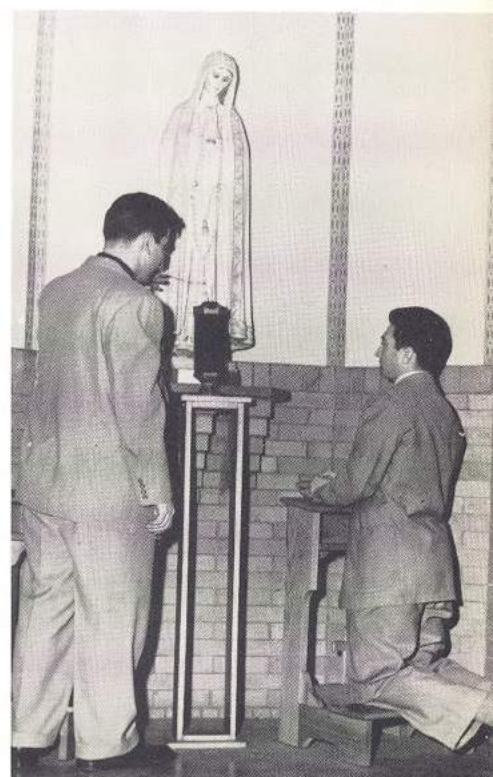
Taking time out to speak with Our Lady.