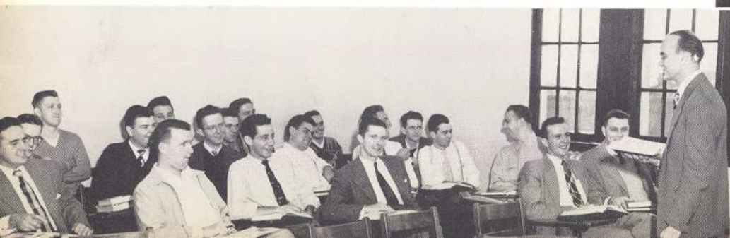
. . . and that's how it was in Bridgeport—shocking, eh!