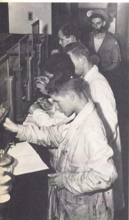
Look who just walked in.