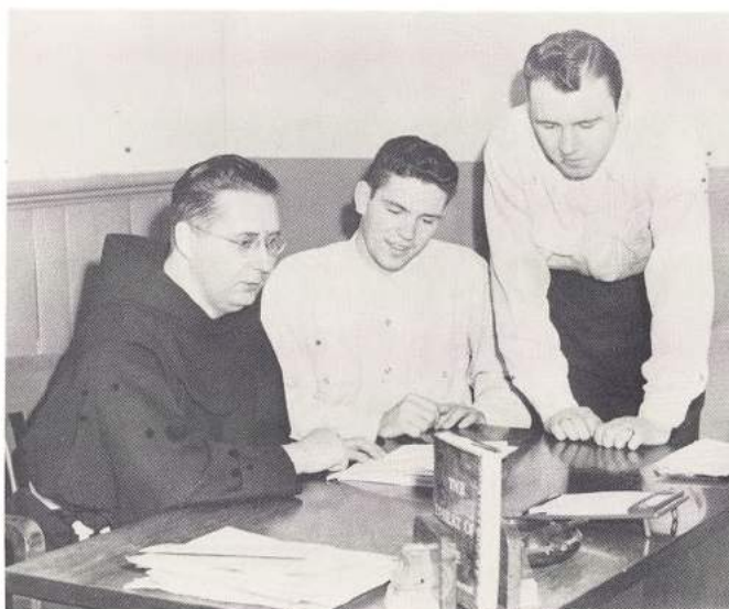
But Brother, I gotta work . . .