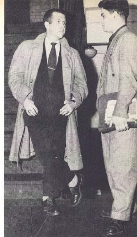
And memorize those muscles and insertion