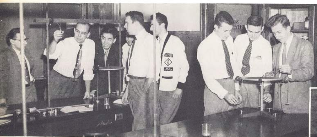
Barbarians busily at work.