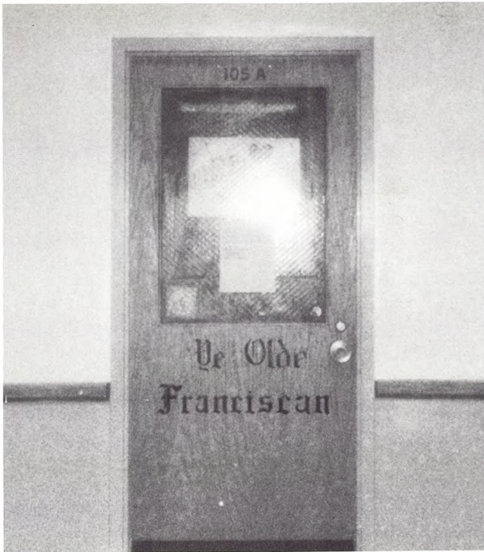
I remember this place