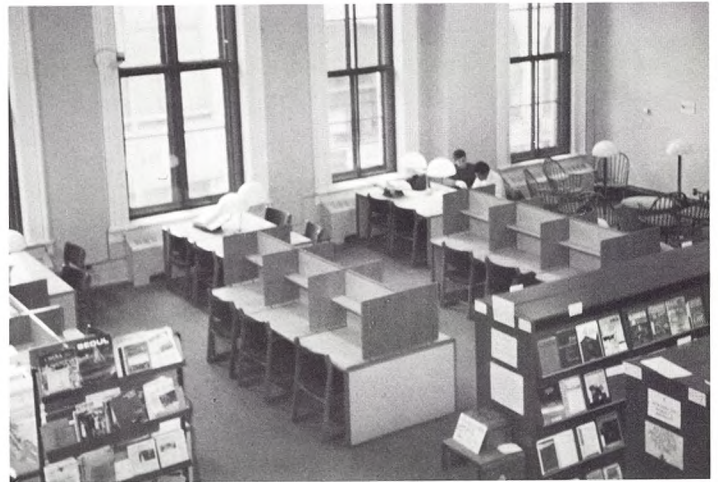
Who said St. Francis students don't study.