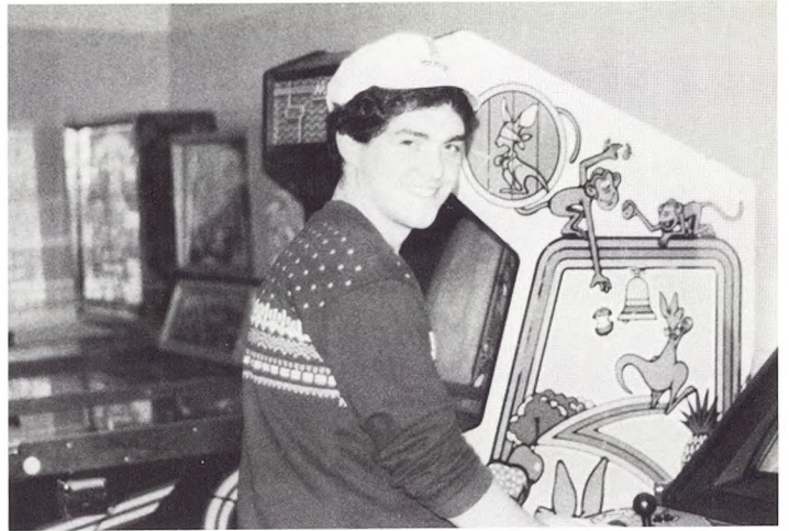
I thought you graduated?