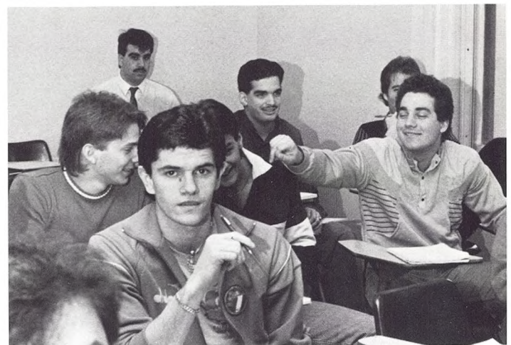
Guess what this is?