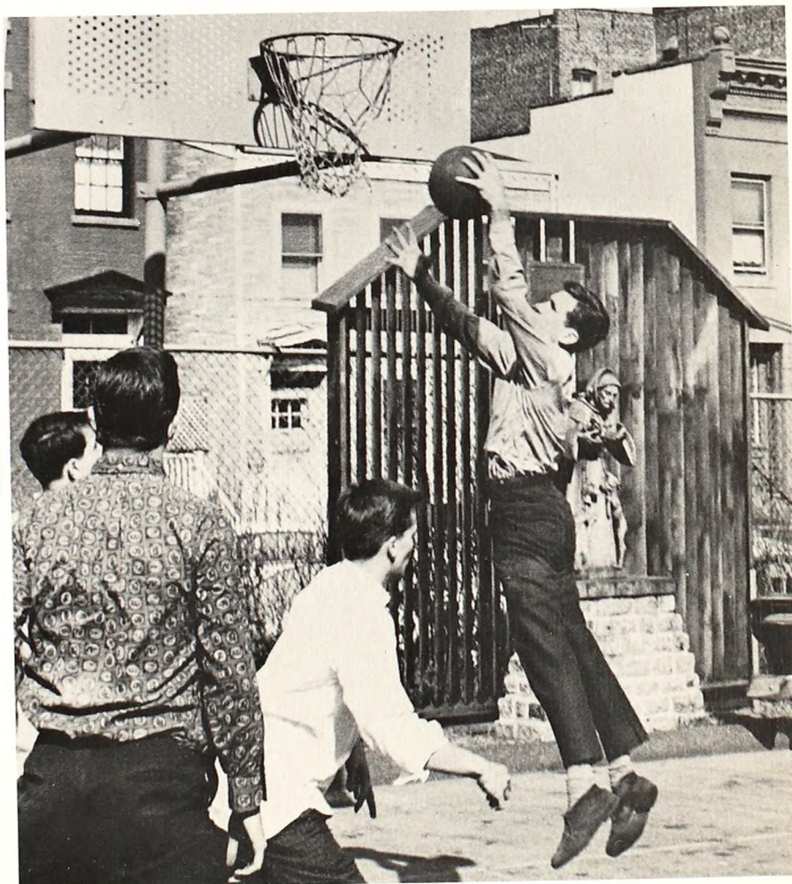
A KEY REBOUND . . . An intramural basketballer grabs one off the boards during one of the final outdoor intramural games.