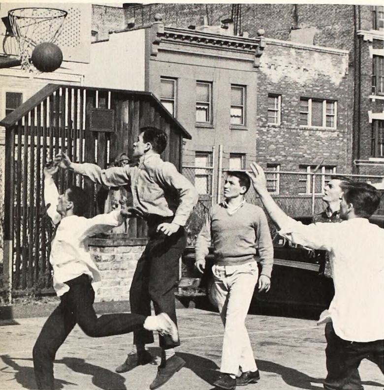
THROUGH FOR TWO. A Frosh Intramural participant drives past an opponent to score in a spirited contest on the Father Moran Courts.

THE INTRAMURAL CYCLE at St. Francis is one of the largest and most varied in New York City. Activities are offered in more than twenty sports including basketball, bowling, foul shooting, golf, handball, swimming and track.