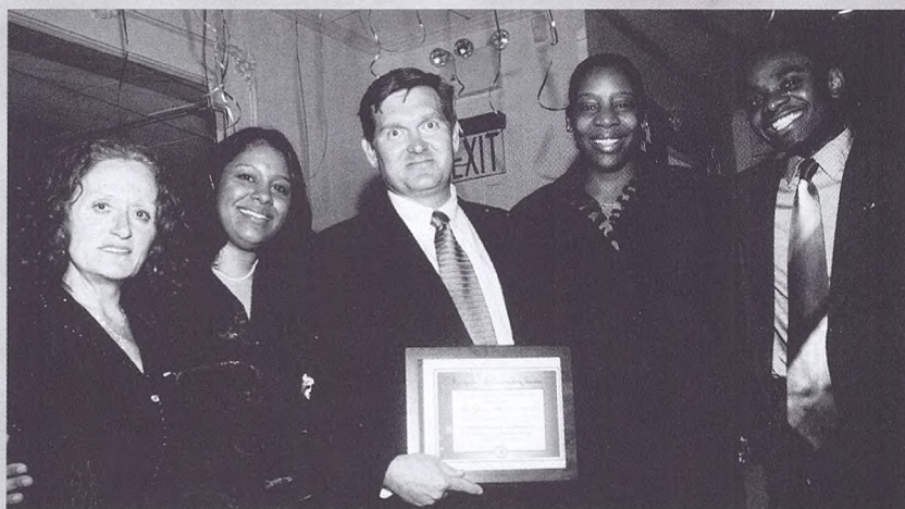
The Student Activities Office receives an award for outstanding services brought to the college