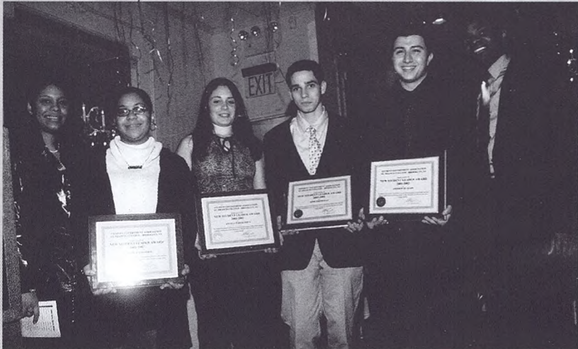
The recipients of the New Student Leader Award