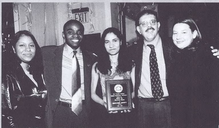
The Education Society becomes Division II Club of the Year.