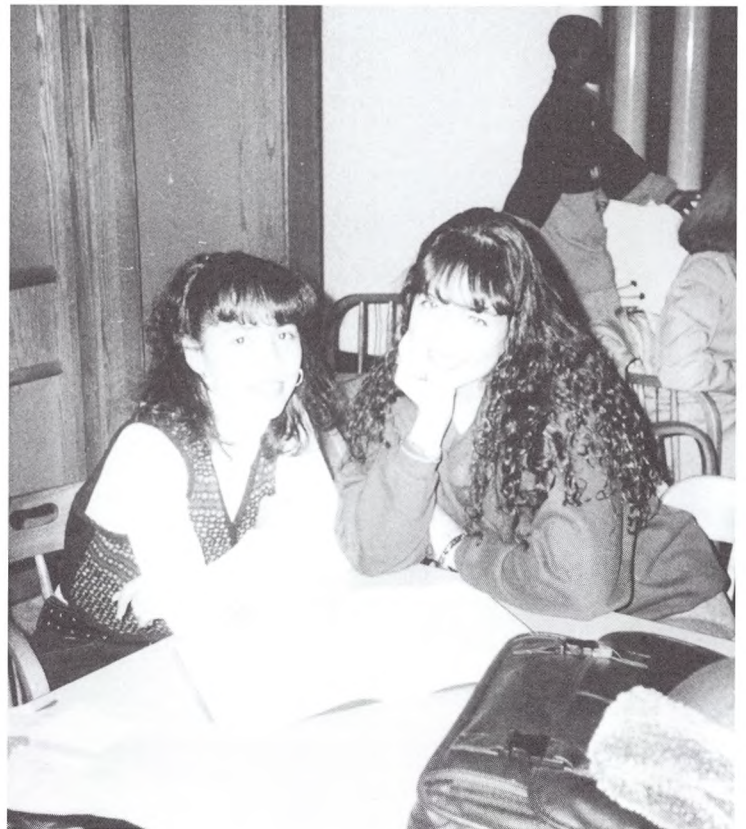
Left photo: Yes, I normally stand like this.