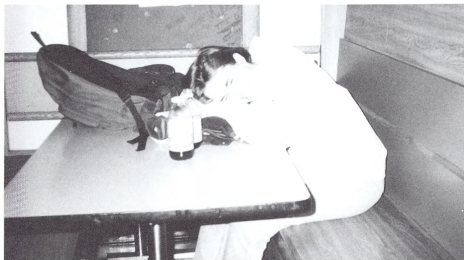
photo at left- It's only the first week of school and they're already falling out!

bottom photo- Supermodels at work! NOT!!!