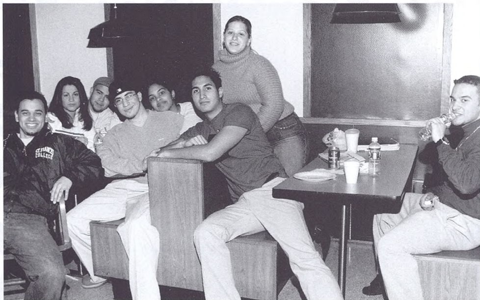
The Latin-American Club and their favorite spot in the cafeteria