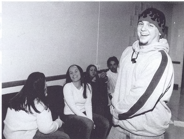
She's watching me, isn't she?