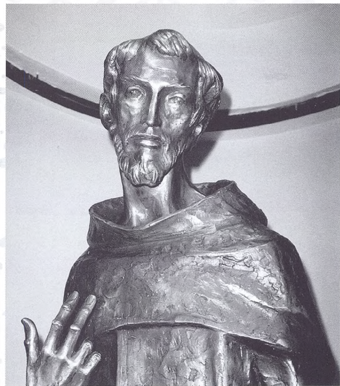
Sculpture of St. Francis, outside Founders Hall