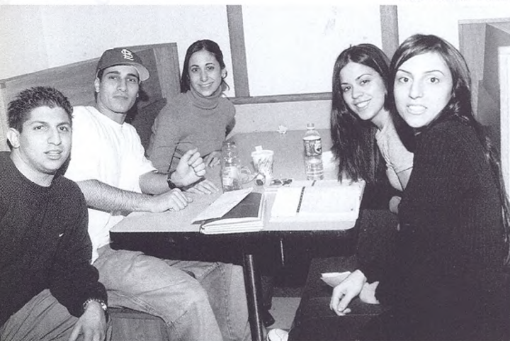
Fact: Women outnumber men at St. Francis College