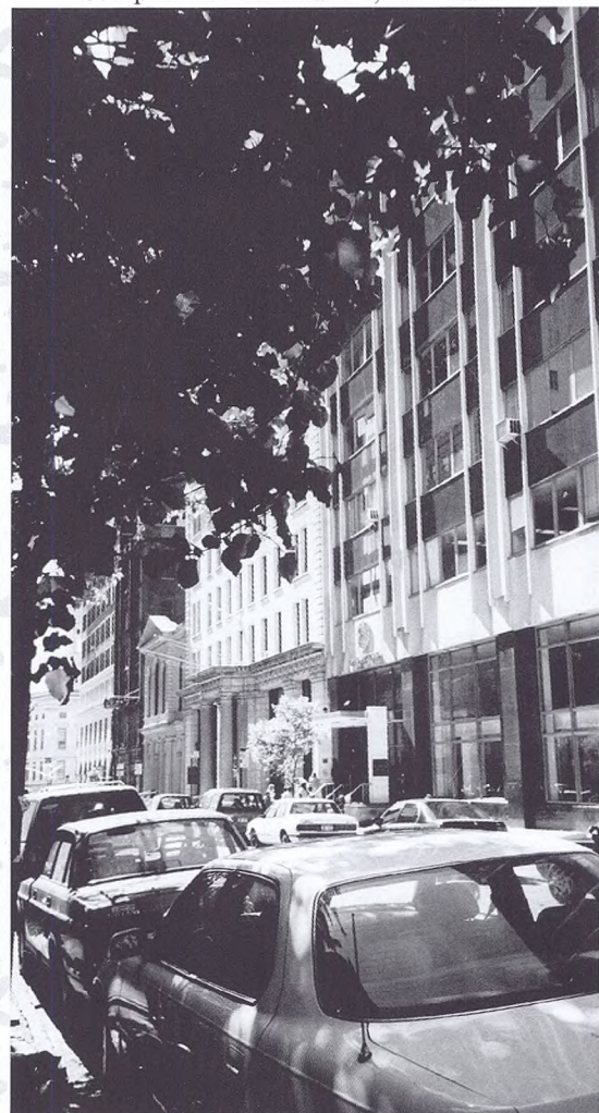
Remsen St. and our college seen from Clinton St.