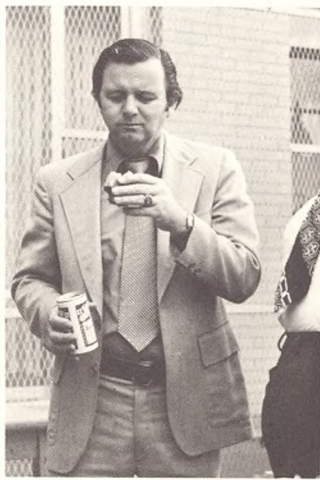
"Boy, this burger is the cat's meow."