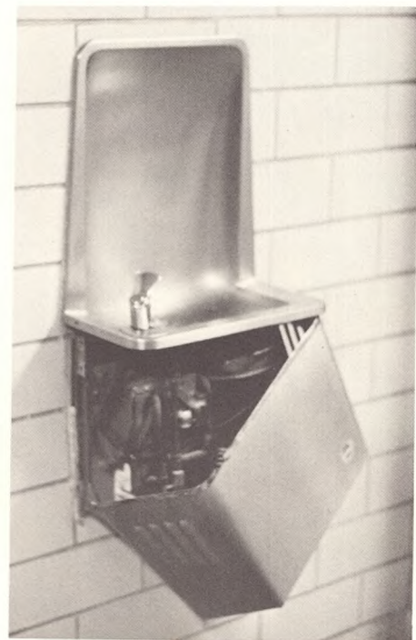
The Jim Mahon Maintenance Award. ►