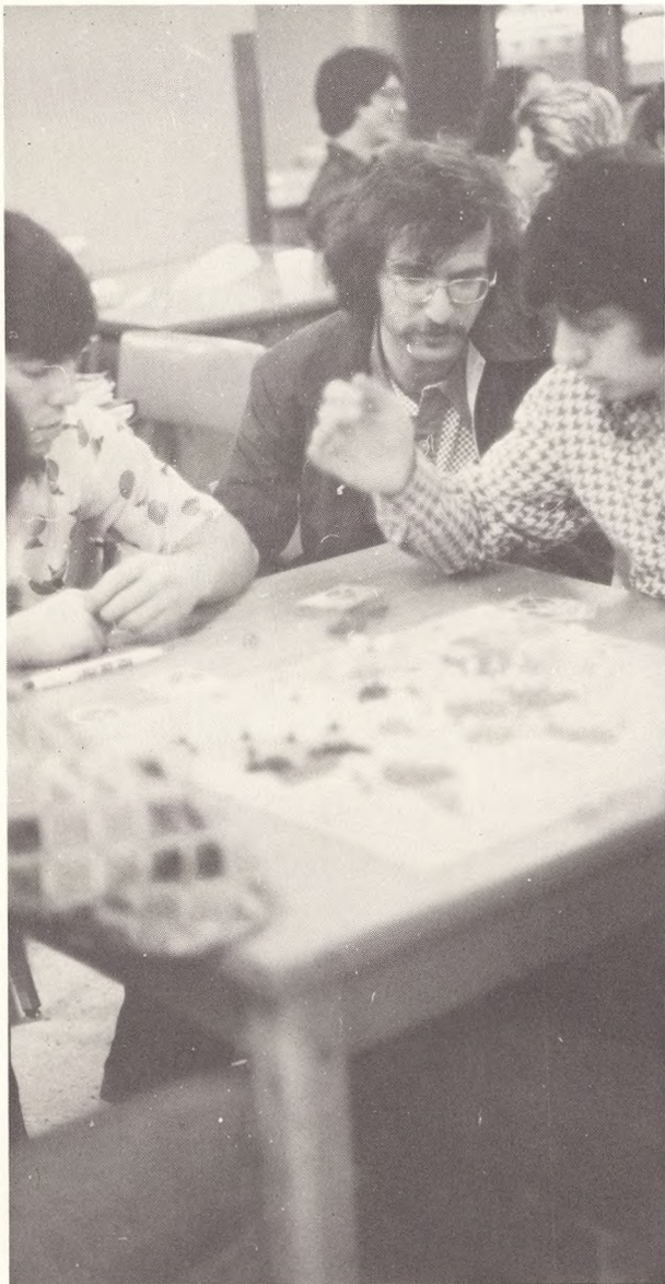
SFC—a life of fun and games.