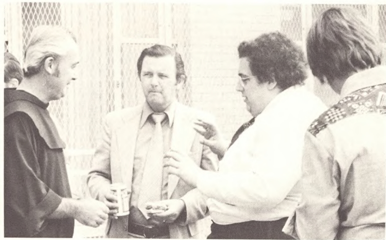
"That's because it's a Rana-burger, 'Two all-cat patties, special sauce, lettuce . . .'"