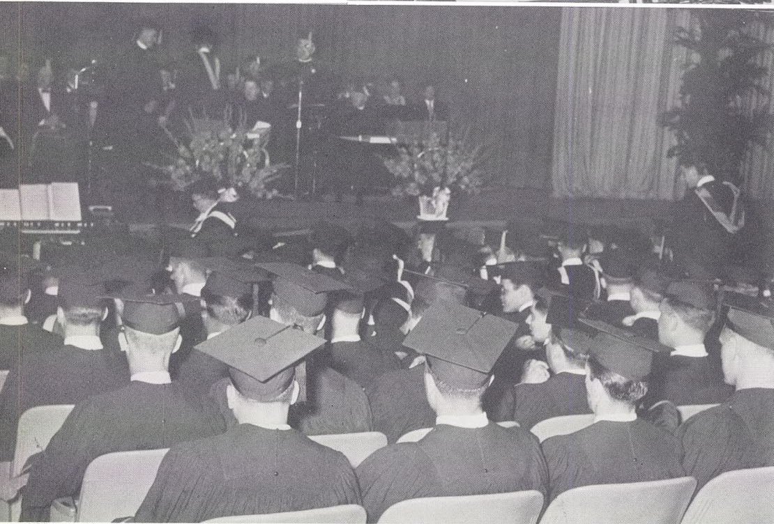
Graduates proceed in turn to receive their honors.