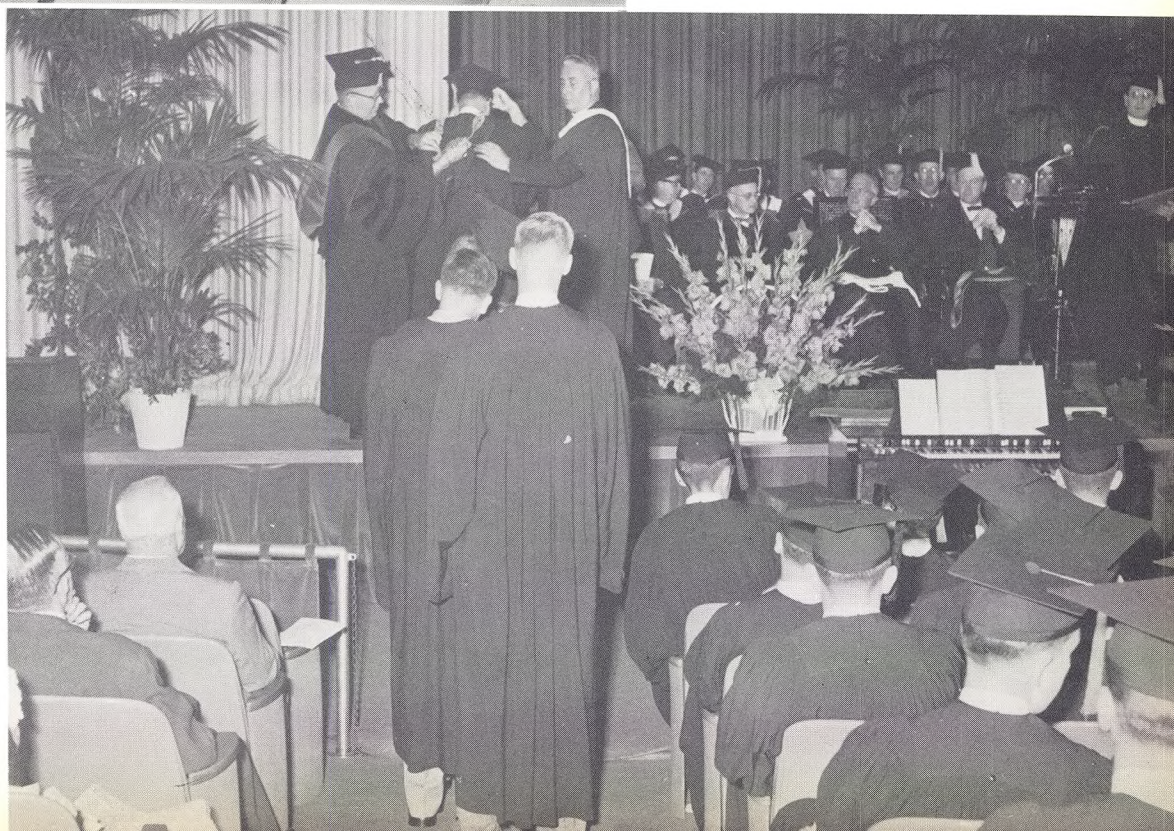
The end of a long journey.