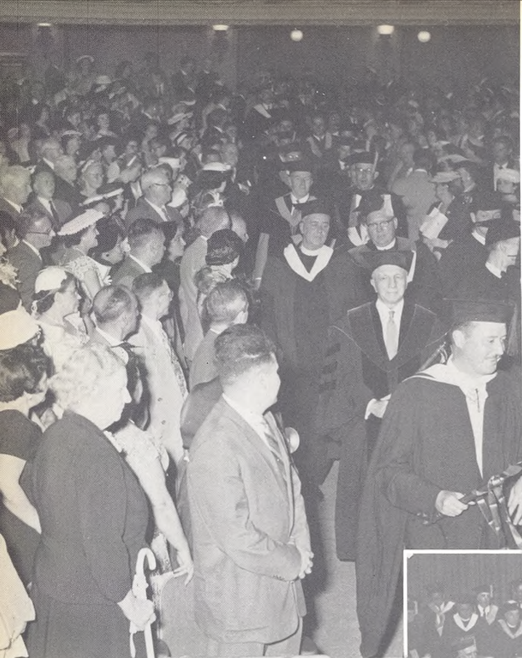
Relatives and friends of the Graduates stand as the Faculty enters the Brooklyn Academy of Music.