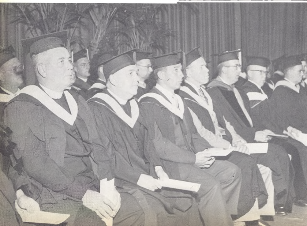
Somber Faculty members personify the solemnity of the exercises.