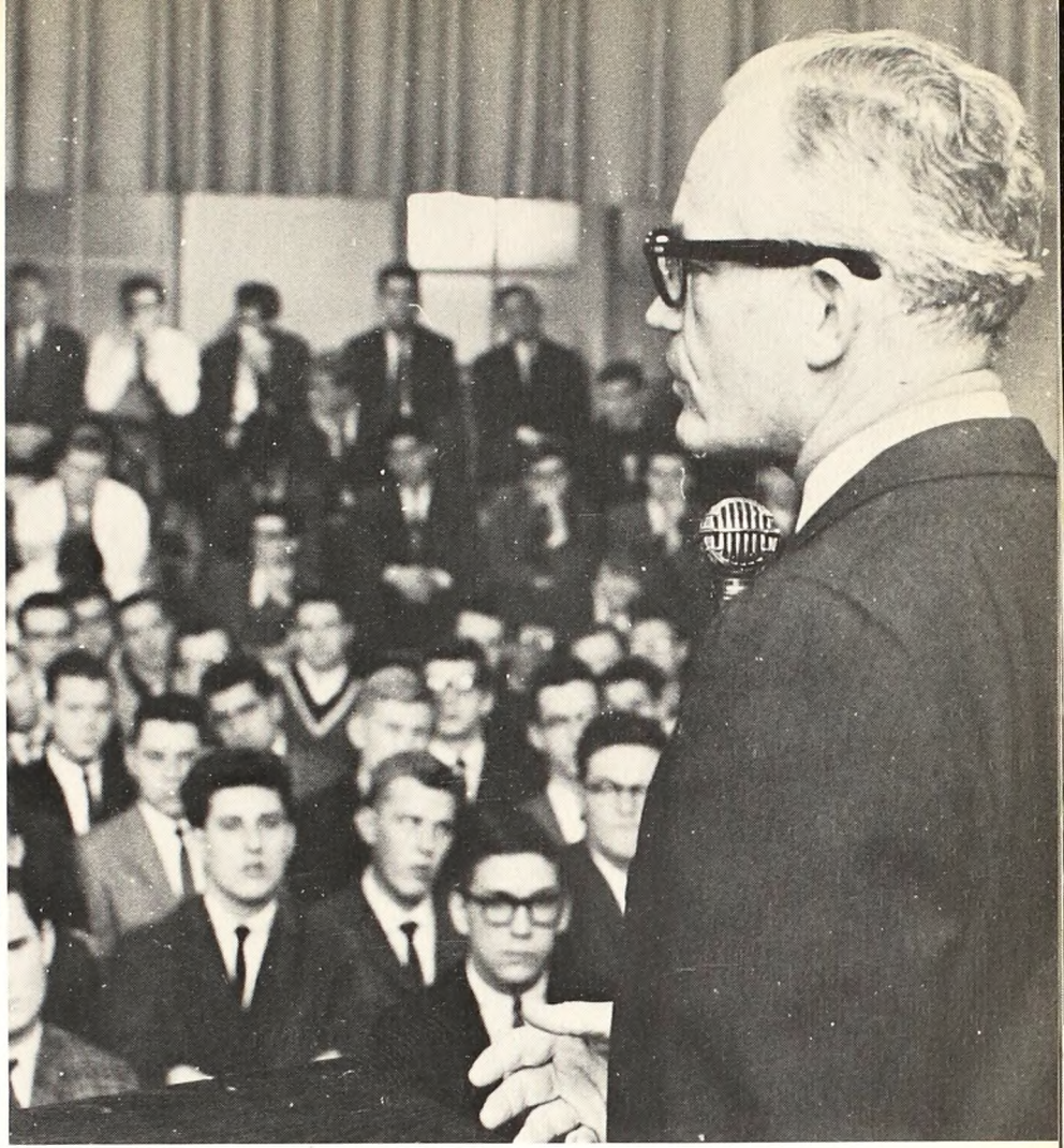
A BIG MOMENT for St. Francis College came when Senator Barry Goldwater addressed the Student Body in the Monsignor Kelly Lounge. Here the Senator answers questions concerning his views on the political scene. Arranged and moderated by the IRC, the Senator's appearance received nationwide press and television coverage and enlarged the cycle of political activity at St. Francis.