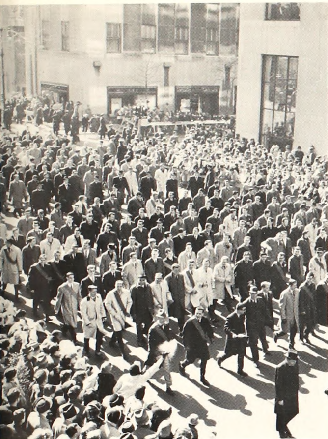
ON THE MARCH FOR ERIN, the loyal sons of St. Francis parade their pride for the city to see. The yearly appearance in the St. Patrick's Day Parade is one of the best public examples of Franciscan solidarity.