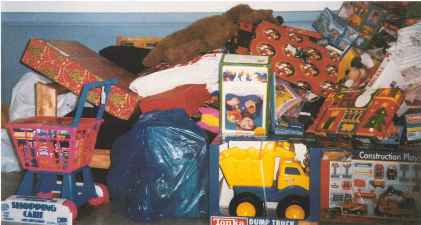
The Association collected over 250 gifts for the children at St. Vincents Services.