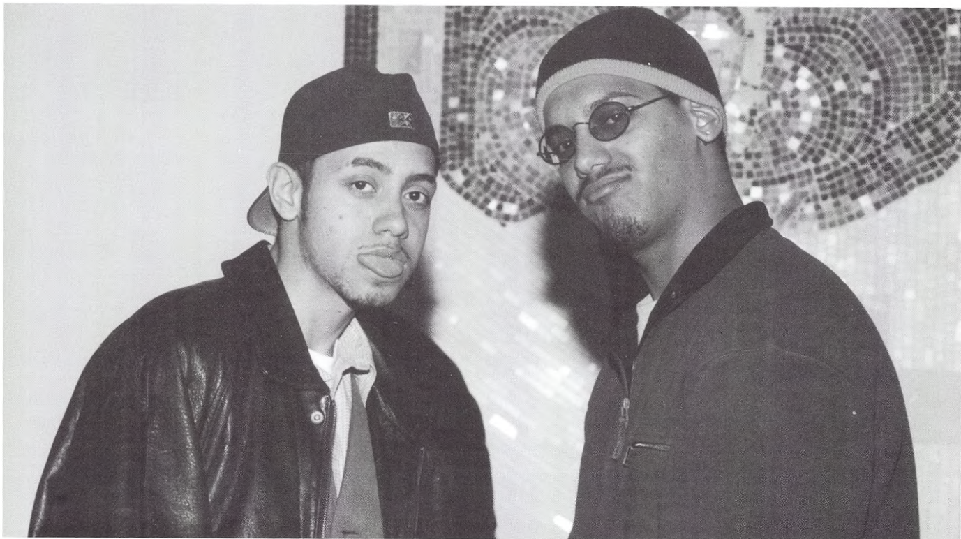
Do you want to see my tongue ring?