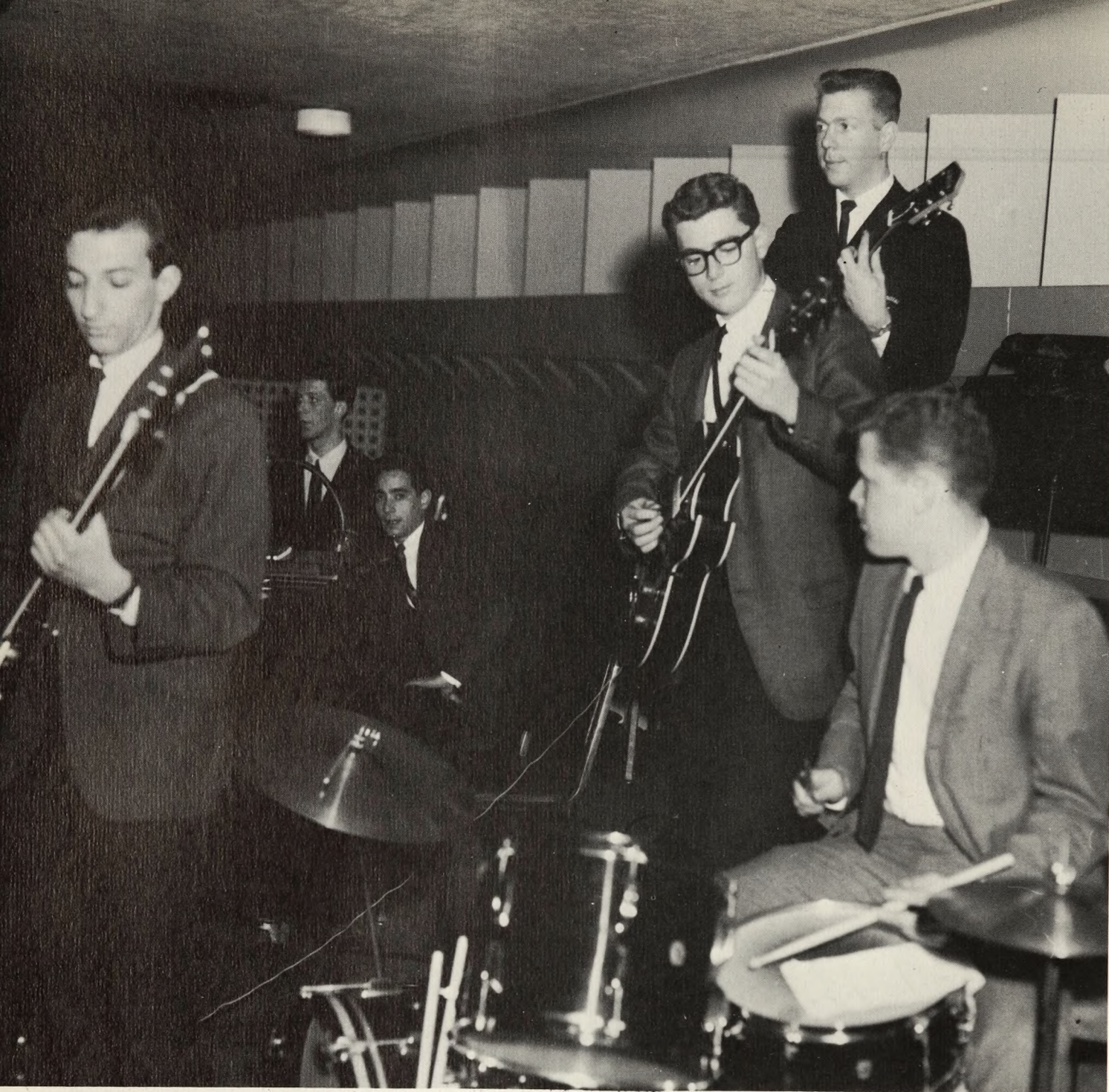
The Campus Tones in action at a special assembly in the St. George Hotel.

An influx of new undergraduate activity brought new life to the 'Campus Tones'. Informal sessions in the lounge were a new and noisy experience that met with both approving and disapproving comments. The music provided at the school functions demonstrated new additions to an already familiar repertoire.