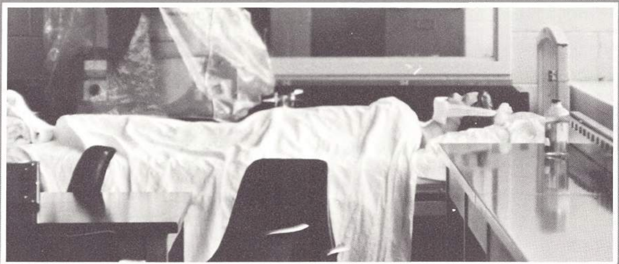
"I told them I'd pay the tuition as soon as possible."