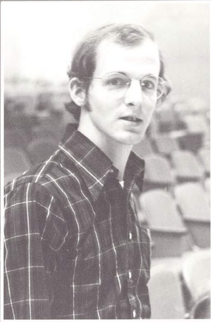
"They elected me WHAT?!"