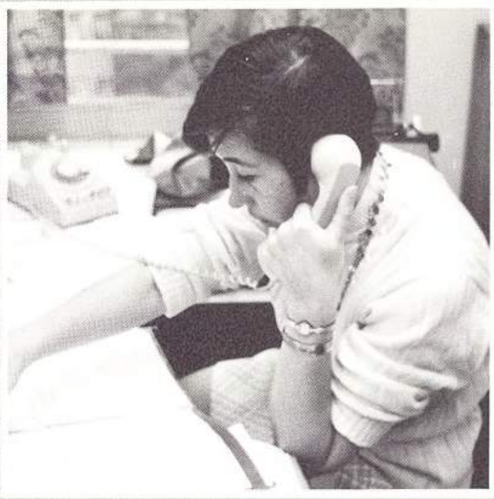
"Irish Mist in the first at Belmont? Can do!"