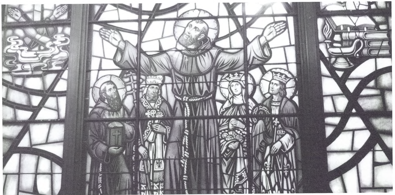
Please Father, have mercy on their final grades.