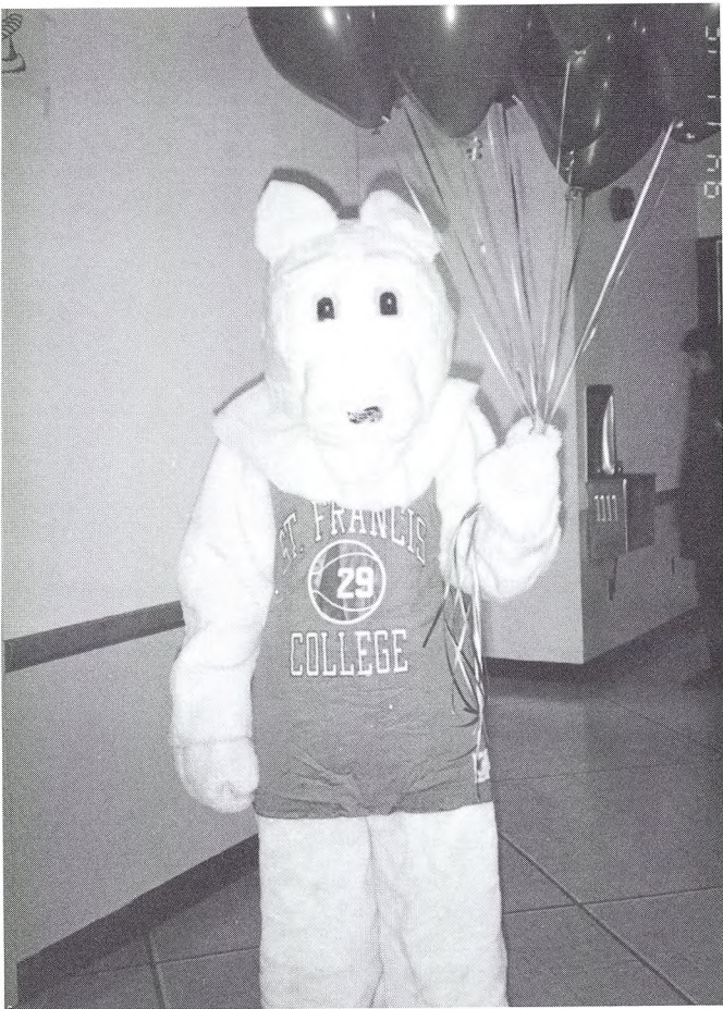
Oops, I have to stand at ease the national anthem is playing.