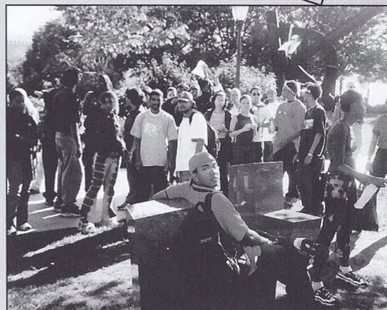
Caribbean Students visiting Washington D.C.