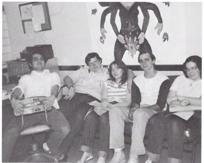
The Editorial Board