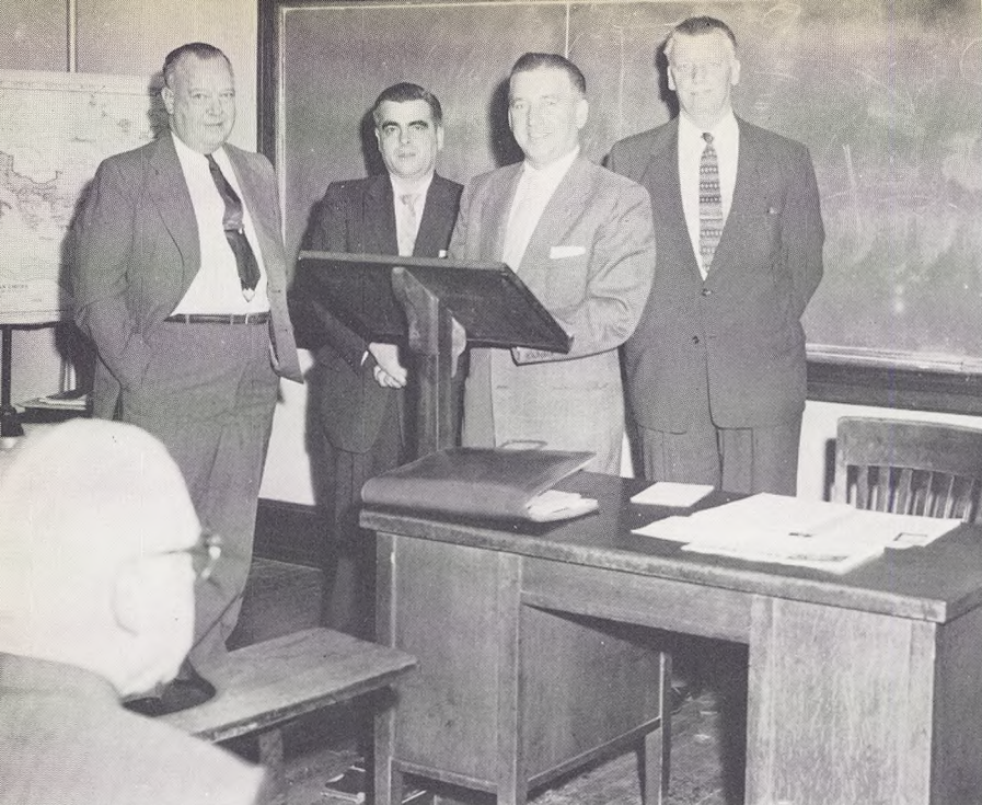
"Dads" present program for anticipated activities.