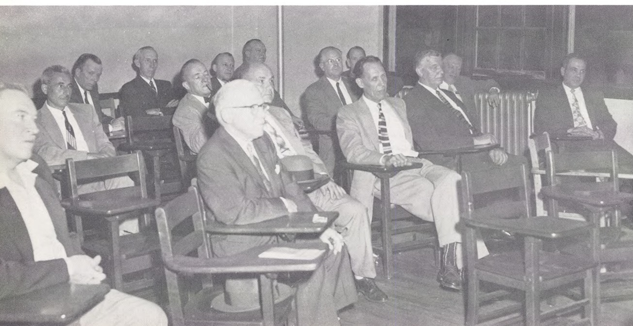
Fathers finish last minute business in preparation for their Annual Communion Breakfast.