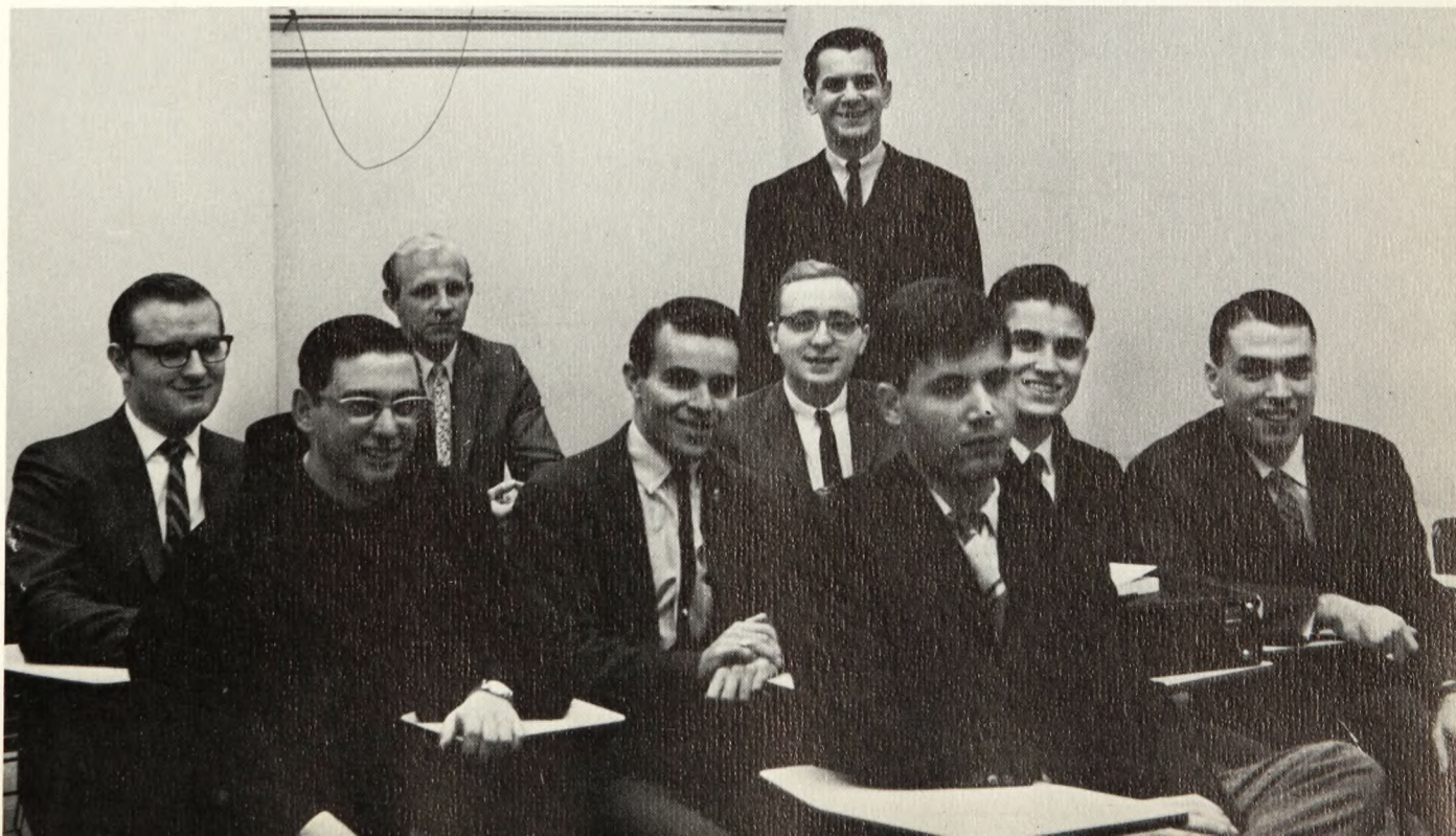
The French Club was one of three language clubs established under the expanded Humanities Activities Program.