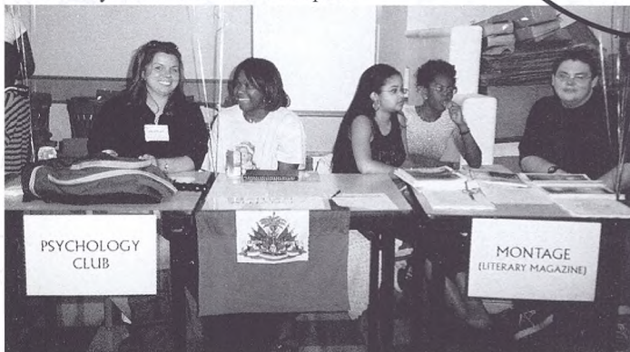
The Psychology Club and The Montage