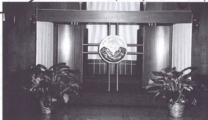
The Chapel, used for weekly prayer services and choir rehearsals