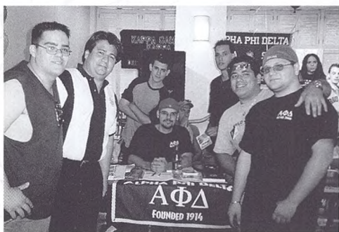
ΑΦΔ Social Fraternity strike a pose