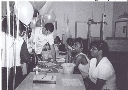
Chemistry Club and the Troupers