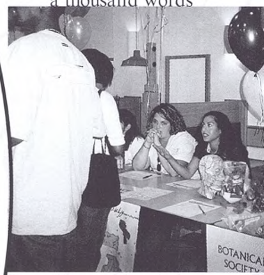
Fact: Human heads and candy always attract new members