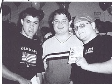
Free publicity for the fraternity