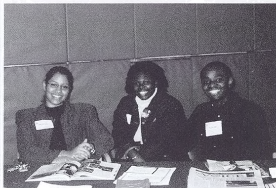
SGA reps presenting the school publications at Open House

This event marks the debut of our Thanksgiving break.