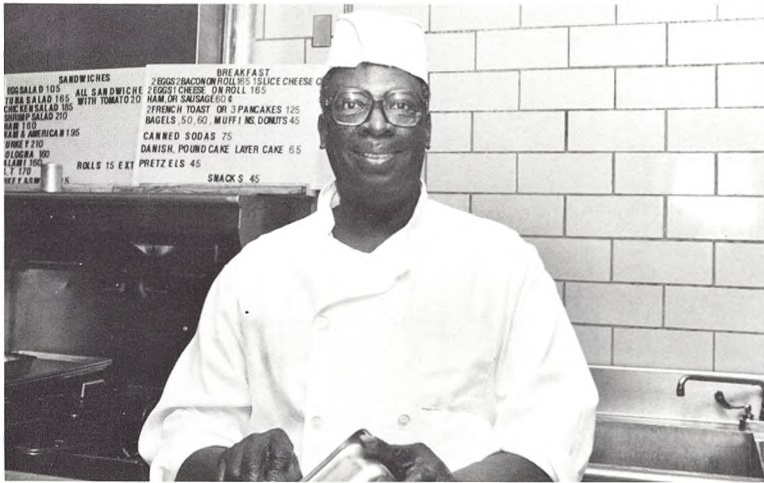
You Can Always Get Fine Food at S.F.C.